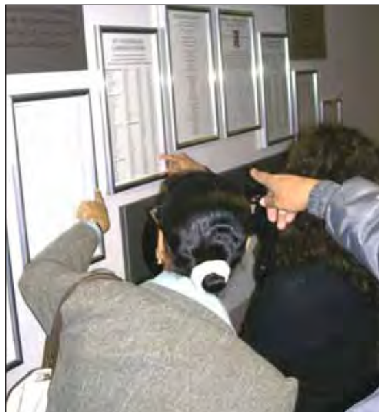
Reception guests gather around the Donor Wall to see the list of Foundation supporters.