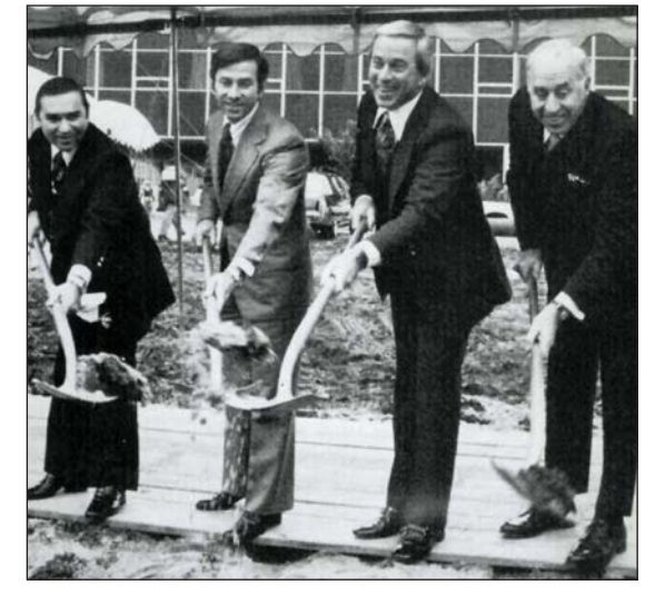
September 10, 1978 groundbreaking for Palisades Medical Center.