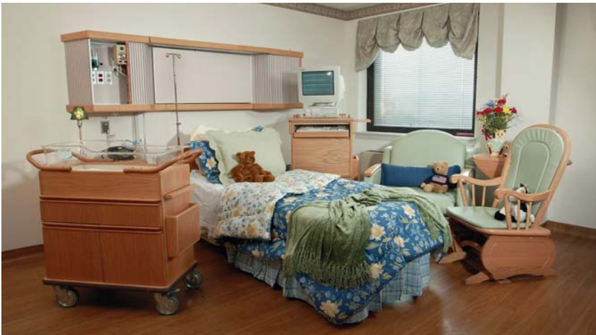
The Maternity Unit earned a 5 out of 5-star rating during the recent assessment of safety and quality of patient care services.