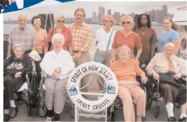
The Harborage residents enjoy a day on the Hudson River.

The Harborage residents celebrated seasonal changes with parties, trips and beautiful views of the Hudson River. This summer, residents joined the active Hudson River boat traffic by taking a cruise on the Spirit of New Jersey and enjoyed being surrounded by skylines and sea breezes. The activity on the river is rivaled only by the Harborage's active social activities inside its beautiful facility.