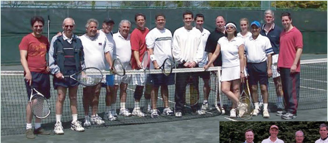
Tennis enthusiasts enjoyed singles and doubles matches