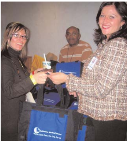
■ Palisades Medical Center recently promoted the work of the hospital during a special event in Hoboken that brought together hundreds of local residents to feast on a variety of fine cuisines and libations. The 19th Annual Taste of Hoboken was held at the Stevens Institute Castle Point and all proceeds from the event supported the Hoboken-North Hudson YMCA.